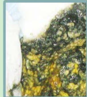
A baby taking iron