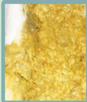
A formula fed baby