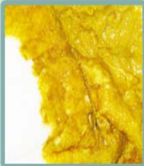
A breastfed baby